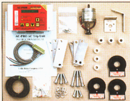
AC-PRO retrofit Kit for G.E. AK-2-25

The AC-PRO can be supplied as part of a complete retrofit kit. Kits include all necessary brackets, mounting hardware, wiring, actuator, and installation documentation and instruction manuals.